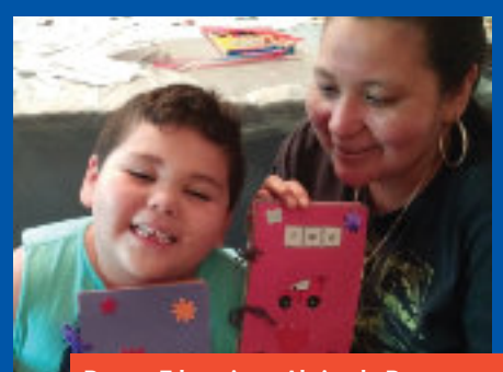
Parent Education - Abriendo Puertas Sponsor a 10 workshop series to help a group of new parents improve their ability to be their child's first teacher and influence the lives of young children. - $5,000

Tell us what you think about the most important challenges in your community and what can be done about them at www.uwcj.org