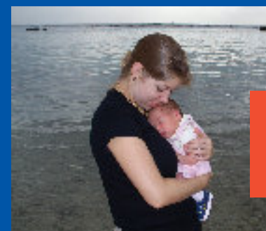
Improve Birth Outcomes – Nurse-Family Partnership Sponsor a year of nursing that reduces at-risk pre-natal conditions and improves early childhood development. - $5,000