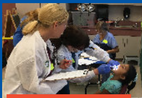
Increase Preventive Dental Care Sponsor in-school assessment, preventive care and follow up for 100 children - $2,500