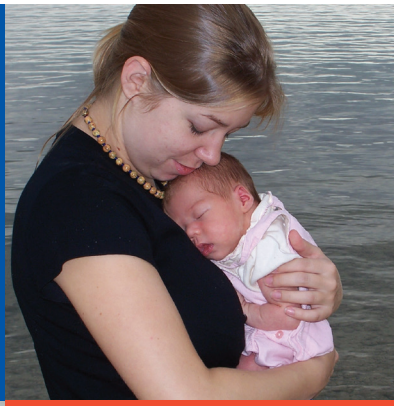
Opening Doors More parents can advocate for their children's health, education and financial stability.