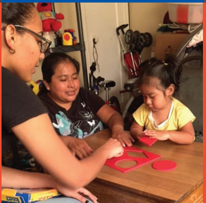
The Parent-Child Home Program

Children participating are 50% less likely to be referred to special education services.