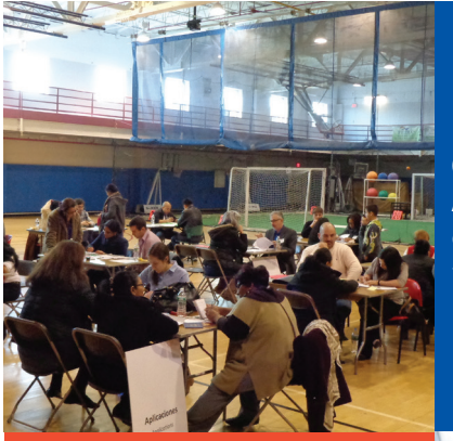
Champion for Coverage Assisted health insurance enrollment and applications for citizenship.

Consider support for United Way of Central Jersey's community impact. Financial resources make successes like these possible and result in more self-sufficiency - reducing expenses for us all.