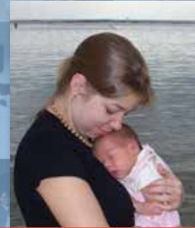
The Nurse-Family Partnership