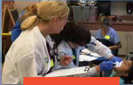
Dental Care in School