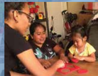
The Parent-Child Home Literacy Program