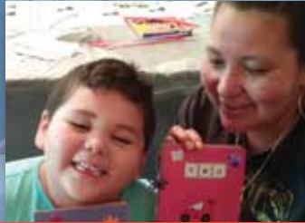
Abriendo Puertas/ Parent Education