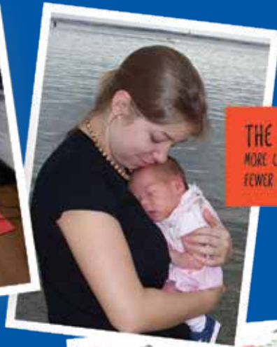
THE NURSE-FAMILY PARTNERSHIP MORE CHILDREN ARE BORN HEALTHY, LESS CHILD ABUSE, FEWER VISITS TO THE ER.