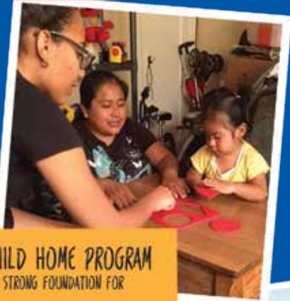
THE PARENT-CHILD HOME PROGRAM ENSURES CHILDREN GET A STRONG FOUNDATION FOR SCHOOL SUCCESS.