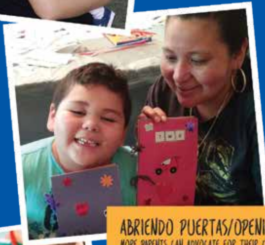
ABRIENDO PUERTAS/OPENING DOORS MORE PARENTS CAN ADVOCATE FOR THEIR CHILDREN'S HEALTH, EDUCATION AND FINANCIAL STABILITY.