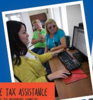
VOLUNTEER INCOME TAX ASSISTANCE OVER $2.2 MILLION RETURNED TO WORKING FAMILIES AND INDIVIDUAL TAXPAYERS.

Consider support for United Way of Central Jersey's community impact. Financial resources make successes like these possible and result in more self-sufficiency - reducing expenses for us all.