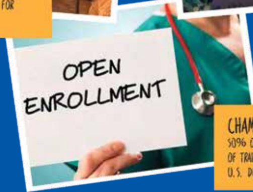
CHAMPION FOR COVERAGE 5096 OF NJ'S UNINSURED NOW HAVE COVERAGE BECAUSE OF TRAINING AND OUTREACH IN PARTNERSHIP WITH U.S. DEPARTMENT OF HEALTH & HUMAN SERVICES.

Tell us what you think about the most important challenges in your community and what can be done about them at www.uwcj.org